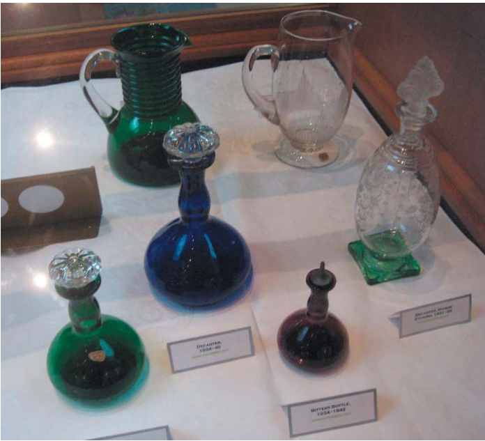
Portland's Rain of Glass exhibit at Multnomah County Library in the Collins Gallery