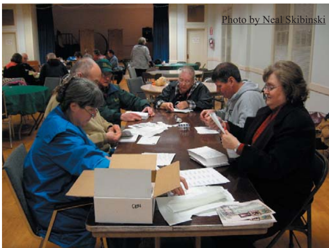
Label Sticking Party after the General Meeting