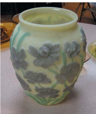
December BRING & BRAG